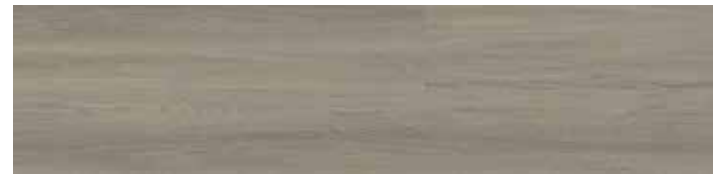
RIVERMIST GREY GUM TID175