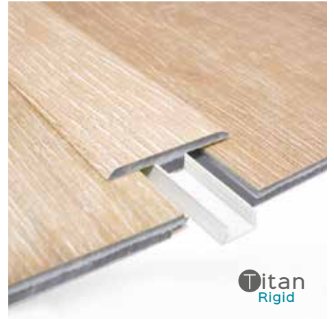
Expansion Cover TIVEXC(-) 2400 x 45mm Matching low profile and waterproof expansion cover