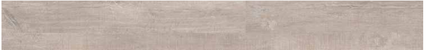
PATINA OAK LIGHT GREY TIC008