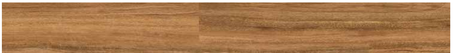
SPOTTED GUM TIC036 / TIC169 NEW FROM MID 2019