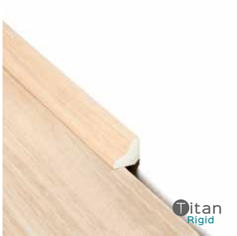
Scotia TIVSCOT(-) 2400 x 15 x 15mm Discreet 15mm matching and waterproof scotia