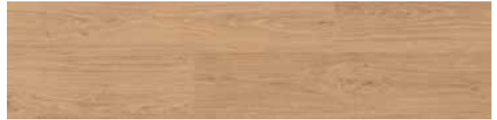
CLASSIC OAK NATURAL TID002