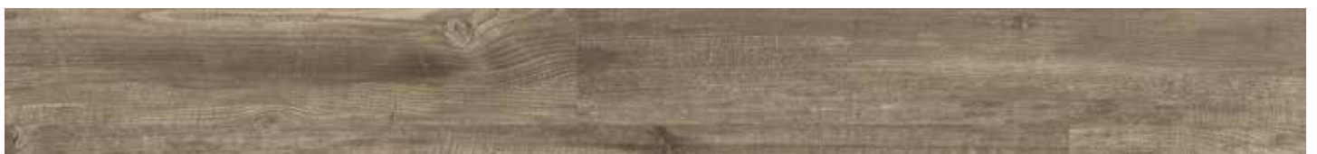
RUSTIC OAK TIC038