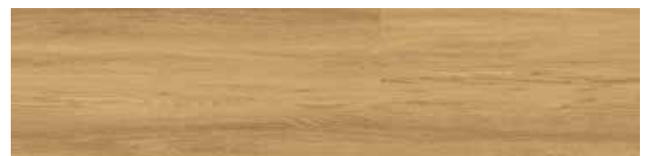
SEASONED PRIME OAK TID173