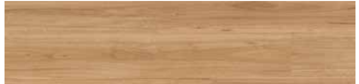
BLEACHED BLACKBUTT TIR171