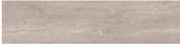
PATINA OAK LIGHT GREY TID008