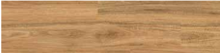
STONEWASHED SPOTTED GUM TIR170