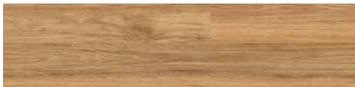
STONEWASHED SPOTTED GUM TID170