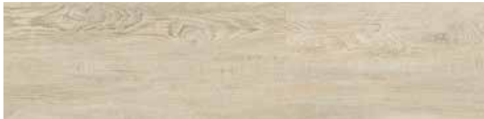
COTTAGE WHITE TID037