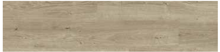
FROSTED IRONBARK TIR179