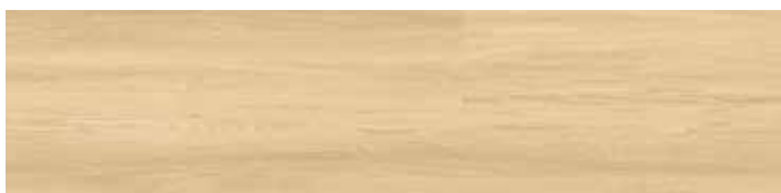
WEATHERED WHITE OAK TID172