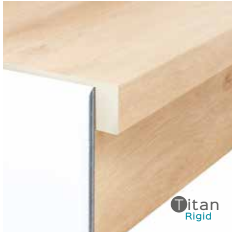
Stair Nose TIVSTP(-) 2400 x 110 x 36mm Matching 'custom look' stair nose to finish stairs beautifully