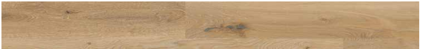
COUNTRY OAK TIC039