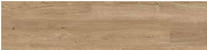
SANDBLASTED BLACKBUTT TIR180