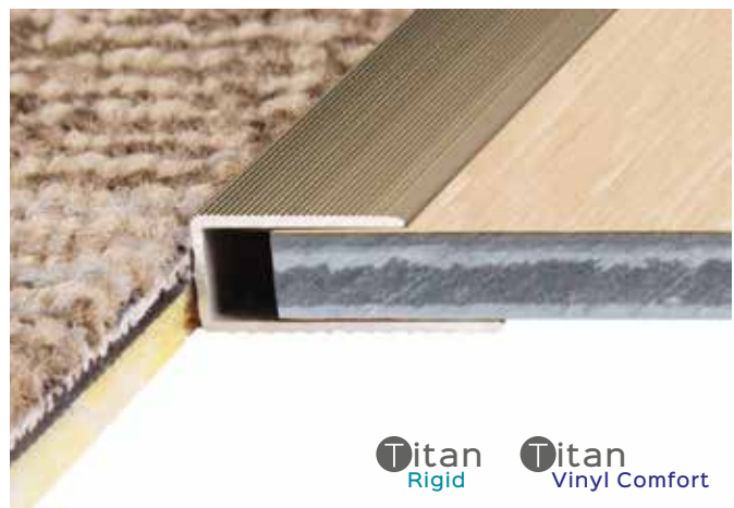
End profile Titan Rigid: RVE3.4CH Titan Vinyl Comfort: VE3.4CH 6mm end profile in champagne finish enabling transitions to floor coverings such as carpet, windows and walls