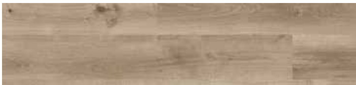
MOONLIGHT GUM TIR182