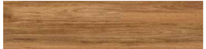
SPOTTED GUM TID036 / TID169 NEW FROM MID 2019