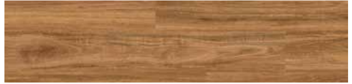
SPOTTED GUM TIR169