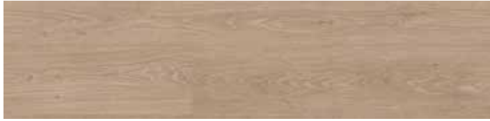
CLASSIC OAK LIGHT BEIGE TID001