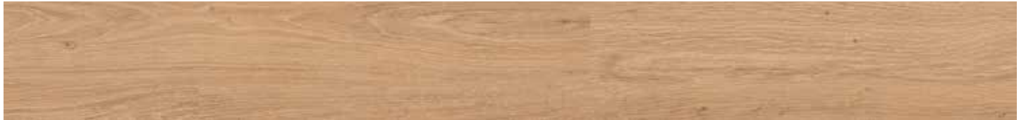
CLASSIC OAK NATURAL TIC002