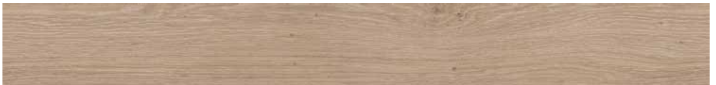
CLASSIC OAK LIGHT BEIGE TIC001