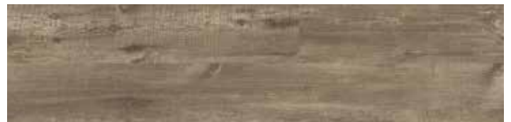
RUSTIC OAK TID038