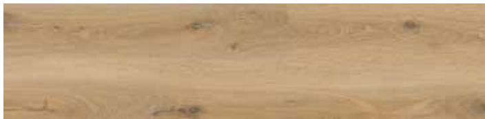
COUNTRY OAK TID039