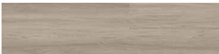
SILVER GREY ASH TID174