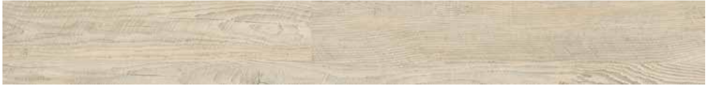
COTTAGE WHITE TIC037