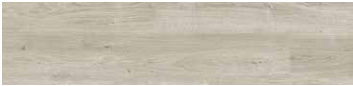
ALPINE GREY ASH TIR178