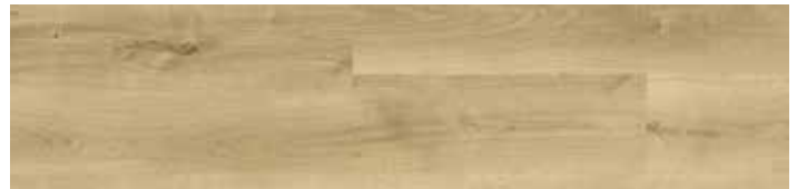
SPRING VALLEY OAK TIR181